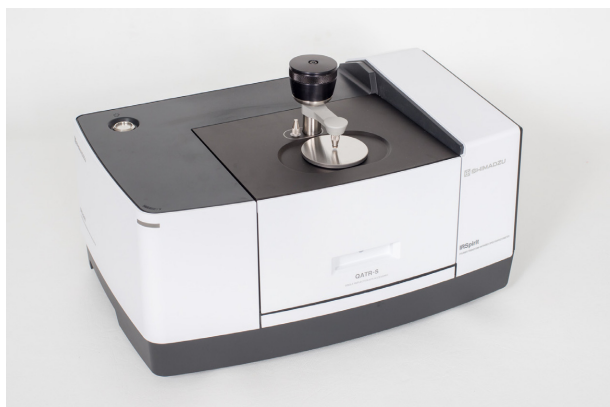
Fig. 1 Appearance of IRSpirit™ + QATR™-S

In Fourier transform infrared spectrophotometry (FTIR), qualitative analysis and quantitative analysis are conducted using the infrared spectrum obtained by irradiating infrared light on the sample. FTIR is the optimum technique for identification testing of samples, as simple and quick measurement of the sample spectrum is possible. The instrument used in the measurements described here was a system consisting of an IRSpirit-T FTIR equipped with a QATR™-S single bounce ATR (attenuated total reflectance) accessory. Fig. 1 shows the external appearance of the system. IRSpirit features a compact and easily portable body with a footprint no larger than a sheet size of A3 paper.