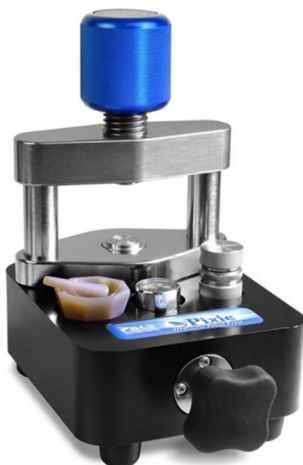
Fig. 1 Pixie 2.5 t Portable Hydraulic Press

Figs. 1 and 2 show the appearance and method of applying pressure with the Pixie, respectively. Pressure is applied by first fixing the pelletizing form by tightening the blue knob at the top so that the device will not move, and then turning the hydraulic press knob on the front. Fine pressure adjustment is possible by checking the pressure gauge.