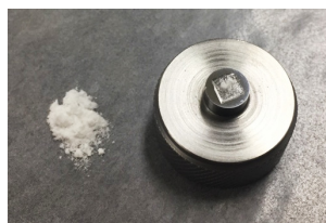
Fig. 5 Measurement Sample

IRSpirit and LabSolutions are trademarks of Shimadzu Corporation.