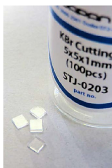
Fig. 4 KBr Cuttings

The Japanese Pharmacopoeia provides the following identification test method for sodium cholate hydrate: "When measuring this material by the potassium bromide disk method of infrared absorption spectrometry, confirm absorption in the vicinities of the wavenumbers of 3400 cm -1 , 2940 cm -1 , 1579 cm -1 , 1408 cm -1 , and 1082 cm -1 ." 3) Pellets were made by KBr Cuttings, and an identification test was conducted using the "Peak detection" function of the Pharma Report identification test program. Fig. 5 shows the measurement sample, and Fig. 6 shows the result of the identification test.