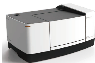
Fig. 3 Compact FTIR IRSpirit™