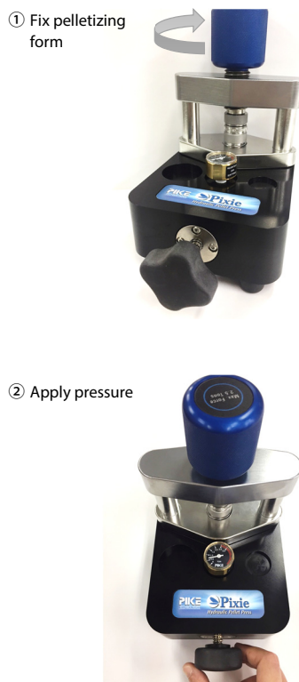
Fig. 2 Method of Applying Pressure